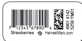
HarvestMark Master Case Labels