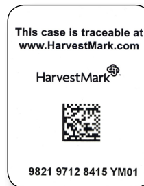
HarvestMark Produce Case Labels