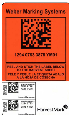
HarvestMark UPC Labels